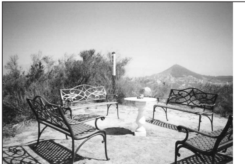
The Temple Site atop Mystery Mountain

most effective way to forge ahead with any new calling or endeavor is to develop a plan of action and organize one's approach and tactics to the new situation. The process calls for clearing the way of obstacles while remaining focused enough to avoid the hindering snares of wayward tangents. So, if you feel a distinct urge to purge your life of outgrown values