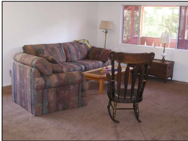
Living Room in the newly renovated "Cloud Nine" Apartment

Our projects are not complete though, as we need to give attention to the adjoining bathroom, and adjust the office space to double as a reading room. The balcony outside the Operations Building leading up to the apartment needs to be replaced, and the surrounding grounds tended ~ just to name a few more improvements. It is more than