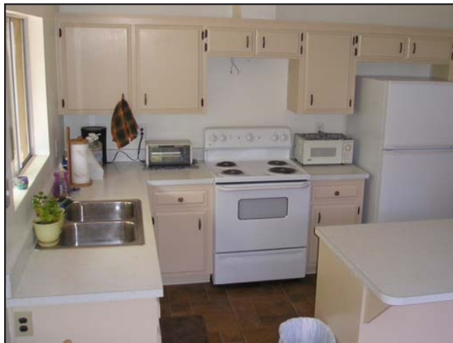
"Cloud Nine" Kitchen Alcove