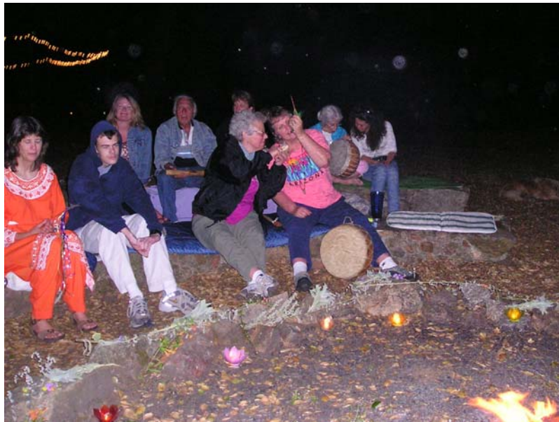
Drumming to the Heartbeat of Gaia at our Summer Solstice gathering in June