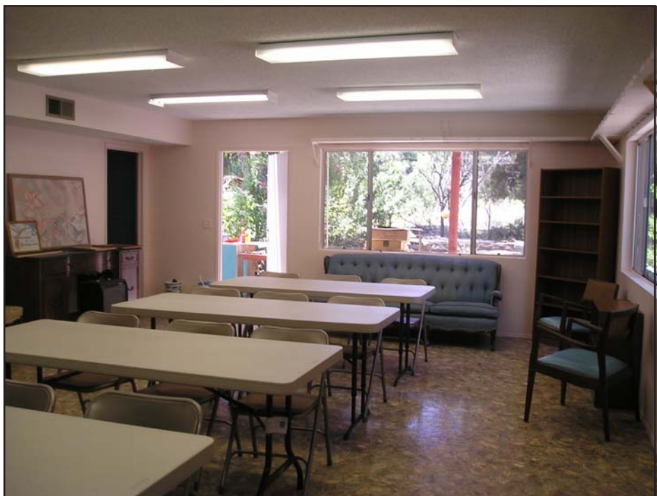
Our newly renovated multi-purpose classroom in the back of the Operations Building